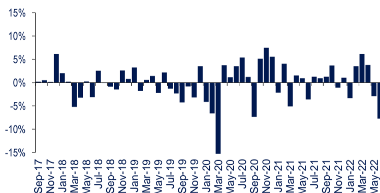
Monthly Returns of Schroder 90 Plus Equity Fund